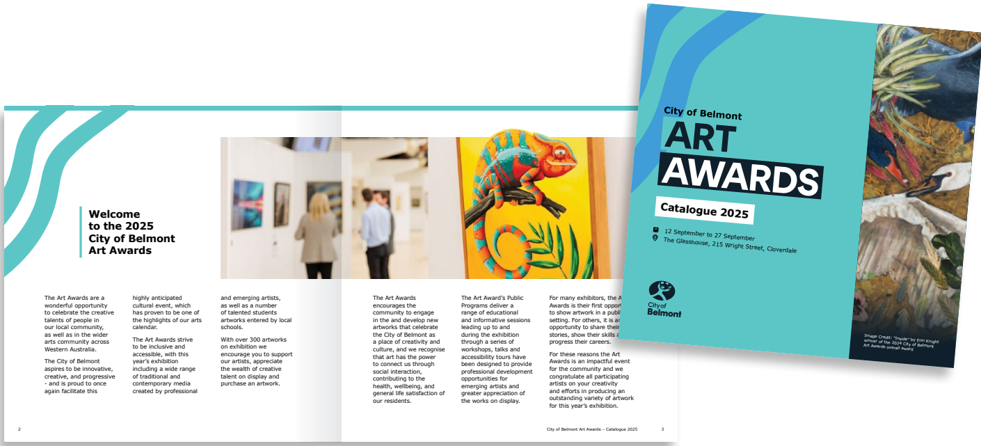
Art Awards Catalogue 2025

The city welcomes in kind sponsorship, with a combination of the above opportunities to be agreed on with the sponsor.