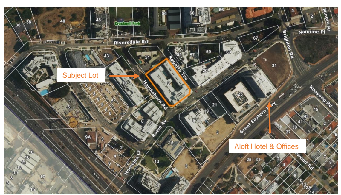
Figure 1 - Aerial of Subject Site