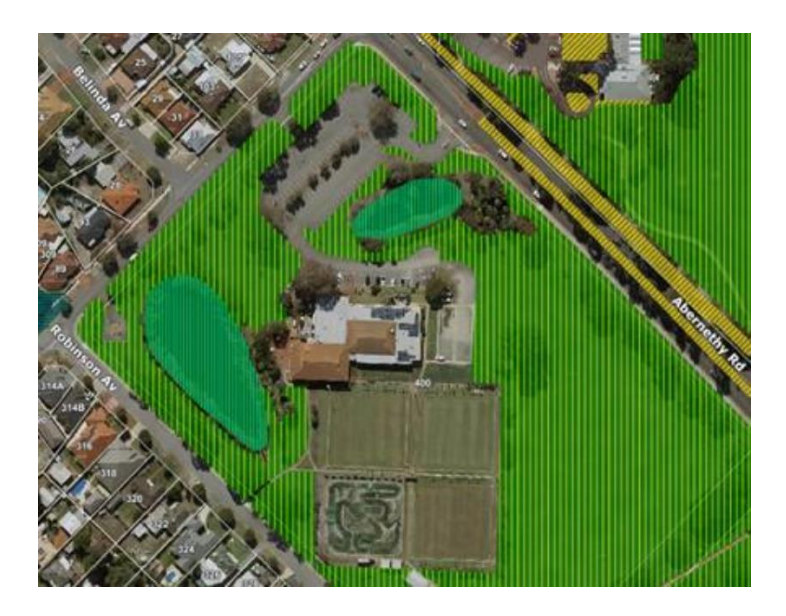
Item 5.1.4 Continued

2. Who issued instruction to McLeods for the ratepayer to pay for this maintenance?