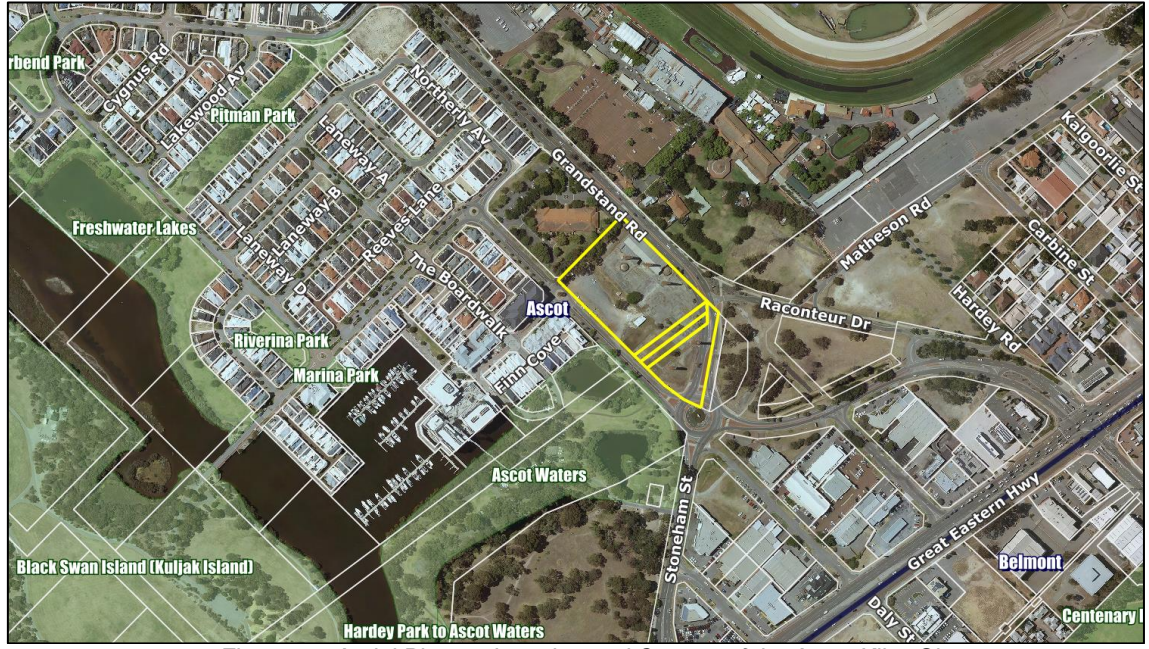
Figure 1 – Aerial Photo – Location and Context of the Ascot Kilns Site

The Ascot Kilns site is located at the intersection of Grandstand Road and Resolution Drive in Ascot. The kilns and stacks are prominent structures at the entry point to the Ascot Waters estate. The property comprises four lots with a combined area of approximately 18,590m2. Part of the lot area is taken up by the Grandstand Road carriageway as reflected in Figure 1 below.