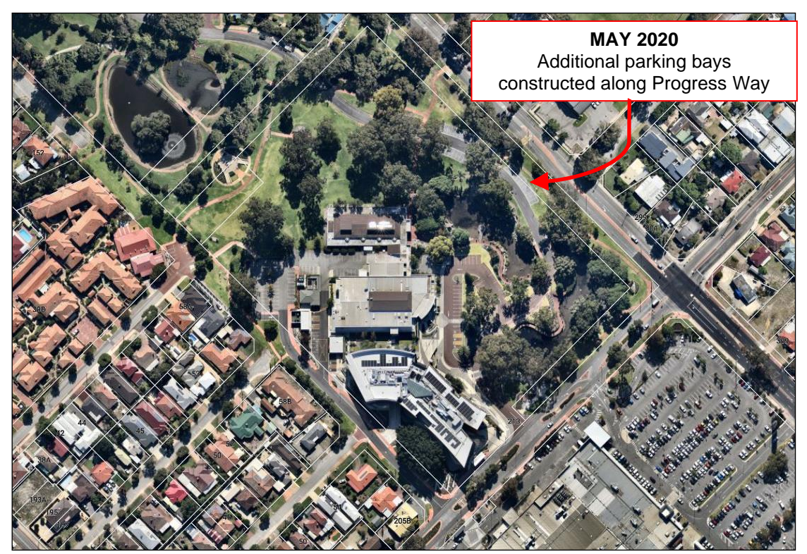
Figure 3 – Additional car parking constructed

Given an increase to 178 seats for the café only requires 11 additional car parking bays and 39 additional bays have been constructed, it is considered appropriate to approve an increase to the number of seats for the café.