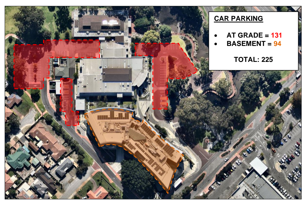
Figure 2 - Location of car parking bays