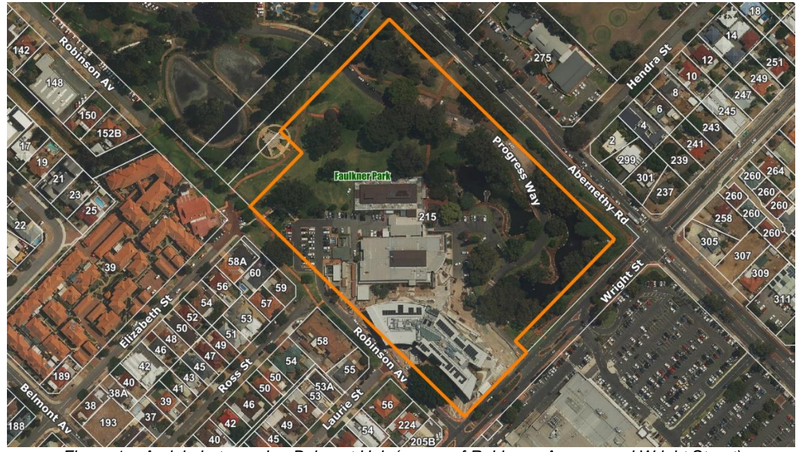
Figure 1 – Aerial photograph – Belmont Hub (corner of Robinson Avenue and Wright Street)

The property known as Belmont Hub is located at 213 Wright Street, Cloverdale. The building is situated at the southern corner of the lot, with frontages to Robinson Avenue, Wright Street and Progress Way as reflected in the image below.