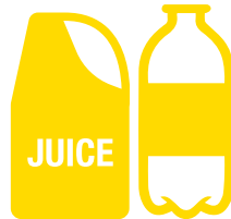
Plastic bottles and containers (lids removed)

Items must be clean, empty and loose in the bin.