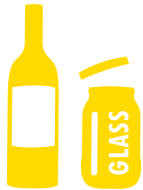
Glass bottles and jars (lids removed)