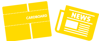
Paper and cardboard (flattened)