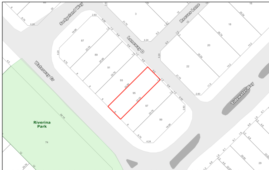
Zoning: Ascot Waters Special Development Precinct