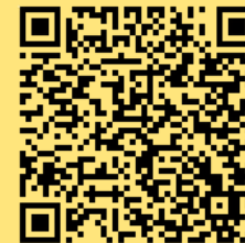
The Y WA Events - 1 Upcoming Activities and Tickets | Eventbrite

Tickets are free but must be purchased through our Eventbrite, Scan the QR code to secure your spot!