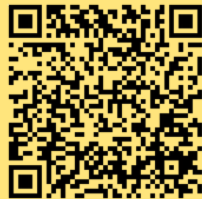
The Y WA Events - 1 Upcoming Activities and Tickets | Eventbrite

Tickets are free but must be purchased through our Eventbrite, Scan the QR code to secure your spot!