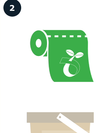
You can collect additional free caddy liners from the City of Belmont Civic Centre or Ruth Faulkner Library.