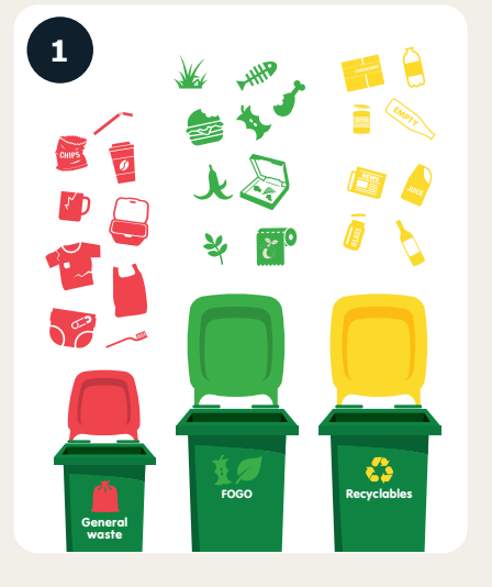
Remember, green for FOGO, yellow for recycling and red for general waste.

A big thank you to everyone who has embraced the new three bin system! Here are some quick tips to keep you on track with FOGO: