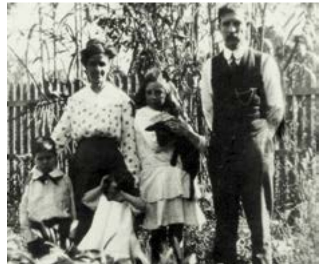
Courtland Family in their garden at Belgravia Street.