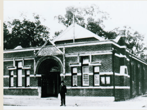
Belmont Roads Board Hall, c1926