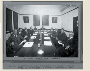
Belmont Park Road Board, 1937

With a lot of opposition from local residents who wanted the shire to move to a more central location, the offices of the Shire of Belmont were built alongside the Old Belmont Hall at 209 Great Eastern Highway, Belmont. The offices were officially opened by the Hon Les Logan MLC, Minister for Local Government.