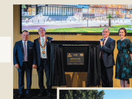
Belmont Hub official opening, 2020.