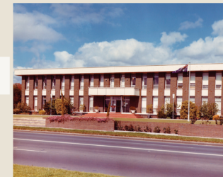
Shire of Belmont Council Offices, c1960s