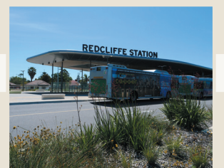
Redcliffe Station, 2023

The opening of the new High Wycombe Airport link saw the establishment of two new train stations with one located in Redcliffe. It is the first train station to be based in the City of Belmont in 135 years.