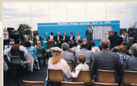
Opening of Redcliffe Bridge, 1988