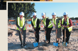
Turning of the Sod, Belmont Hub construction project, 2018

Belmont Hub is a multi-purpose centre including Ruth Faulkner Library and Belmont Museum, providing a wide range of services and activities.