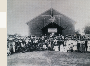
Opening of the Riversdale Hall, 22 February 1919

A new public hall was officially opened opposite the Belmont Primary School on the corner of La Page Street and Guildford Road. It was occupied by the Belmont Roads Board the following month.