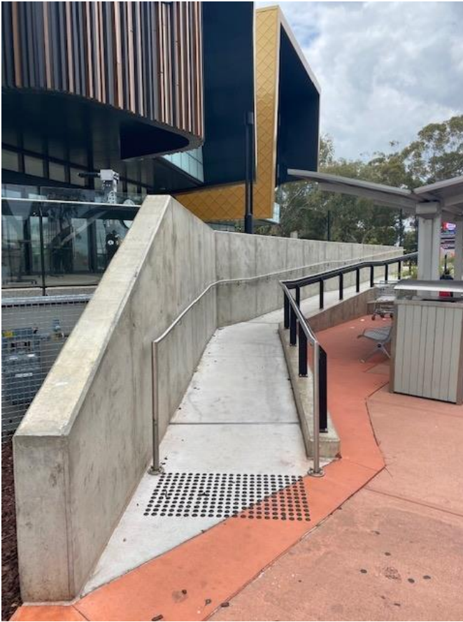
Image 2: External ramp wall from Wright Street leading to Belmont Hub showing the vertical planes of the concrete ramp wall leading from Wright St to plaza level entrance to Belmont Hub (concrete wall 1-2m high x 24m long) with option to consider utilizing the interior area of the balustrade railing.