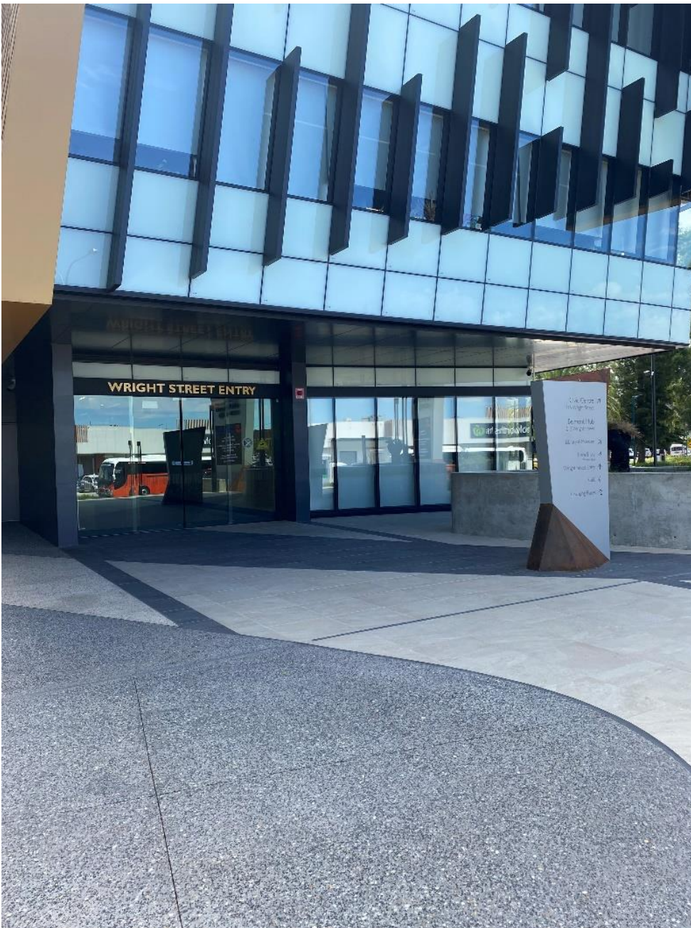
Image 1-3: Ground plane in forecourt area in the vicinity of the entrance and concrete planter box.