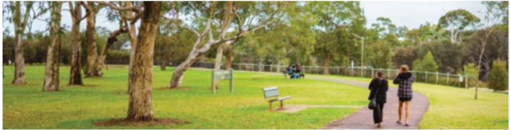
Public open space