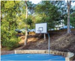
Indoor/Outdoor sports courts