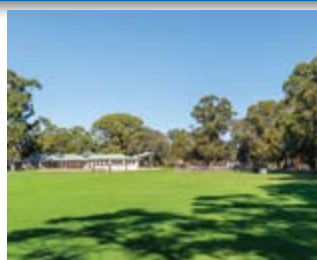
Multi-purpose community halls