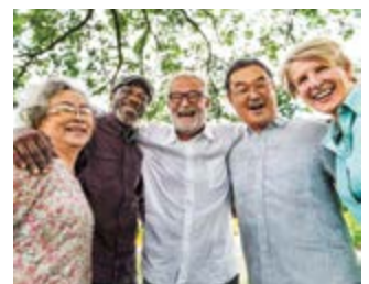
Youth, family and seniors' activity centres