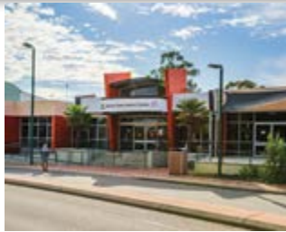
Leisure and recreation centres