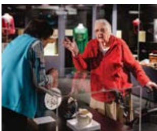
Seniors' housing and care