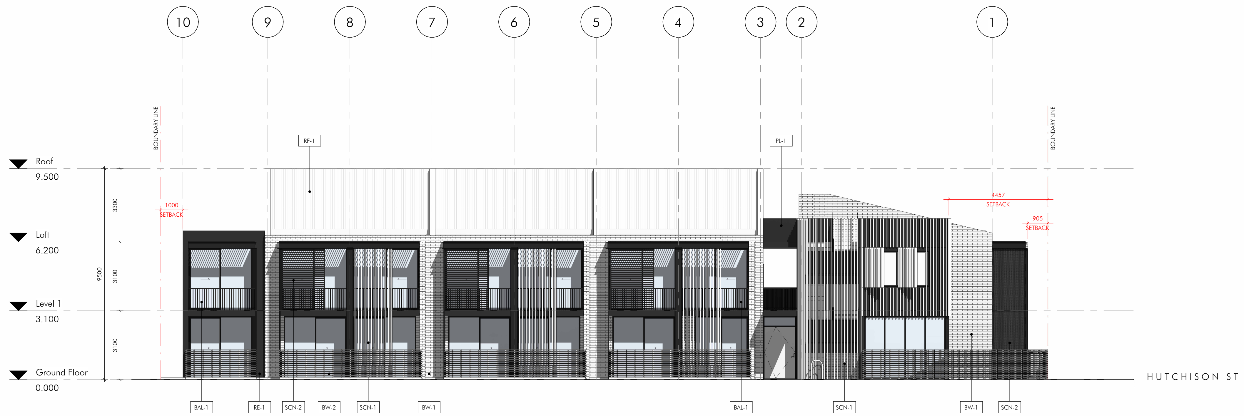
1 NORTH ELEVATION 1:100