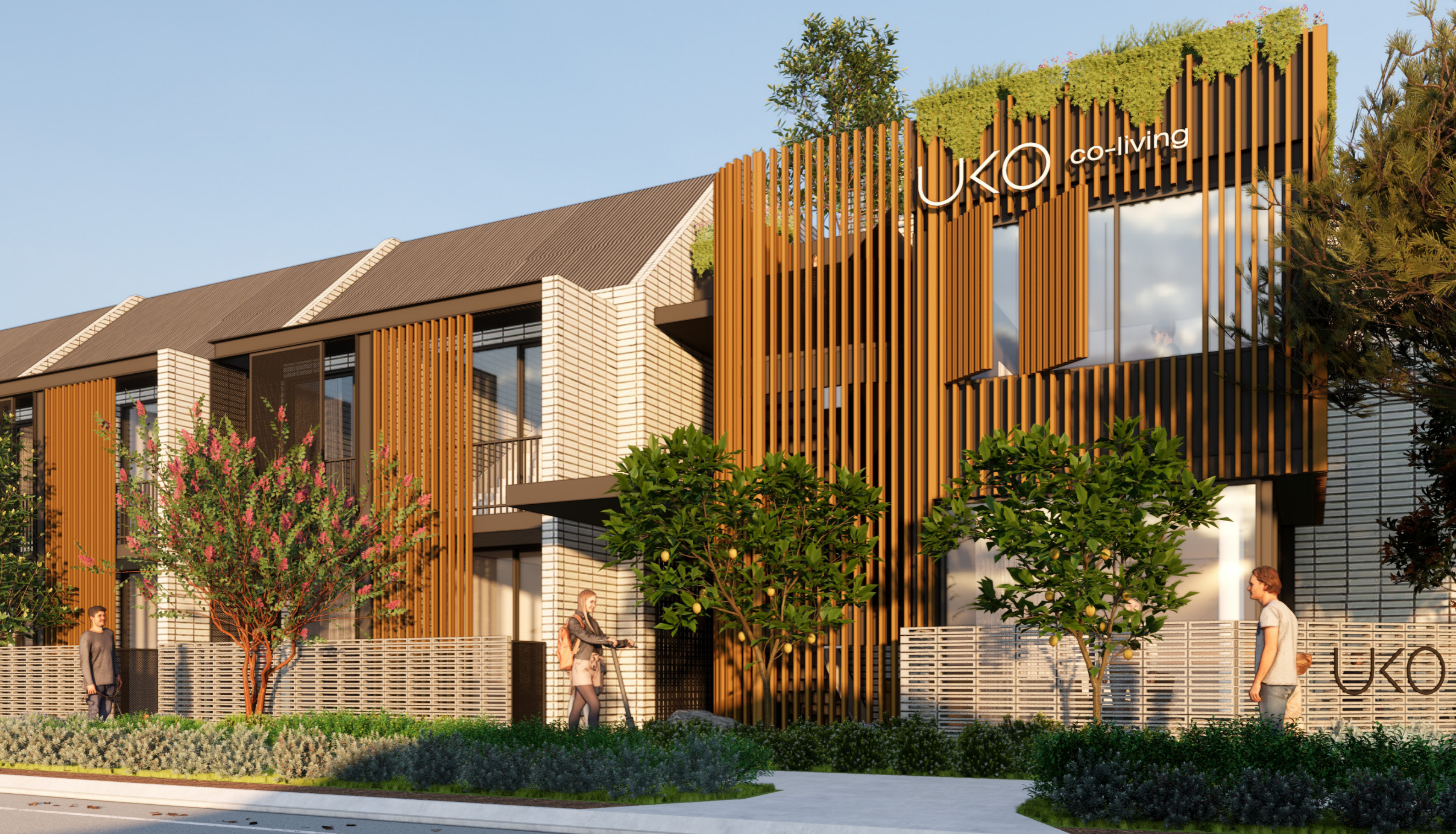
View from Alexander Road

CITY OF BELMONT RECEIVED 21/03/2024 Application No: 91/2024