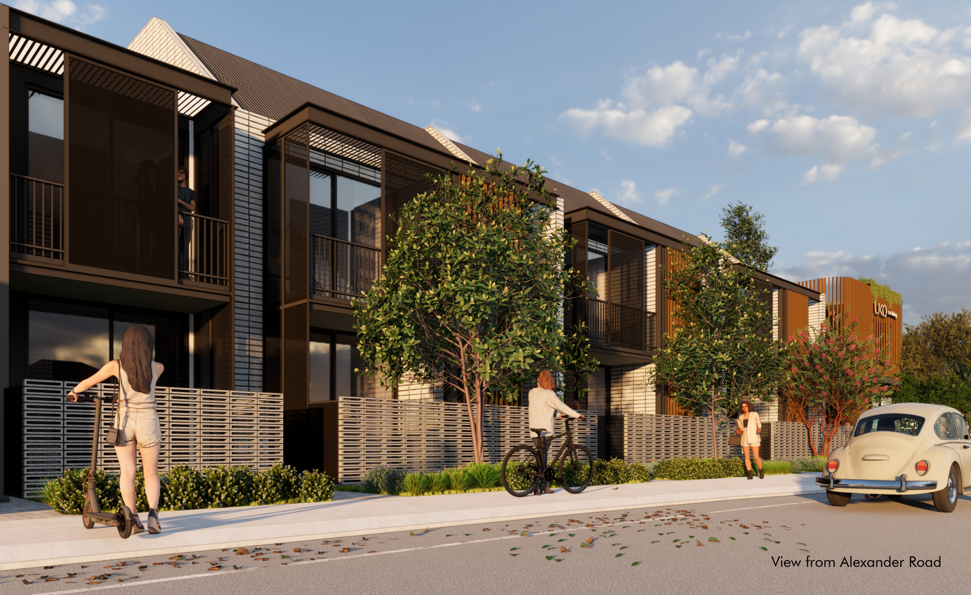
View from Alexander Road