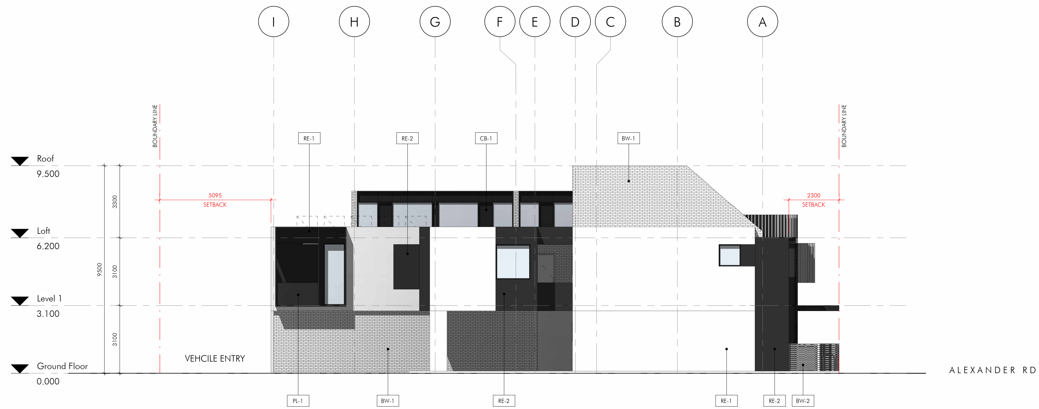
1 EAST ELEVATION 1 : 100