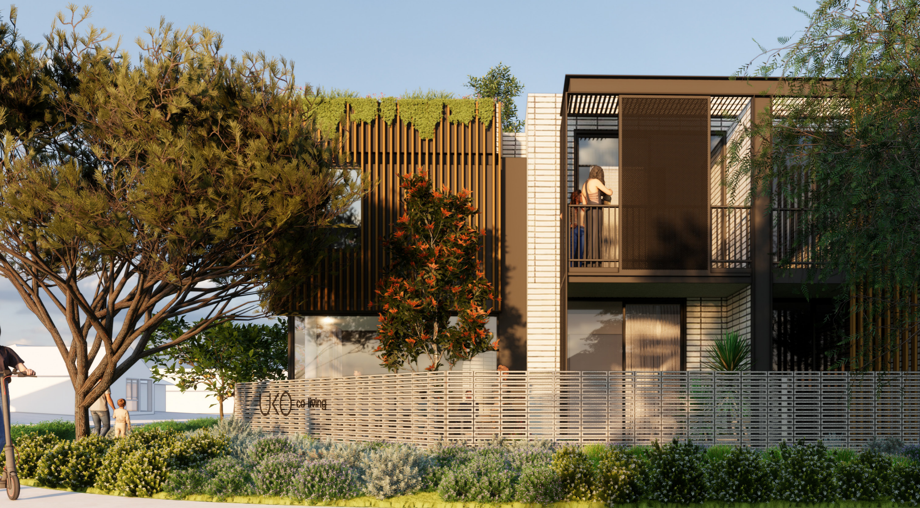
View from Hutchison Street

CITY OF BELMONT RECEIVED 21/03/2024 Application No: 91/2024