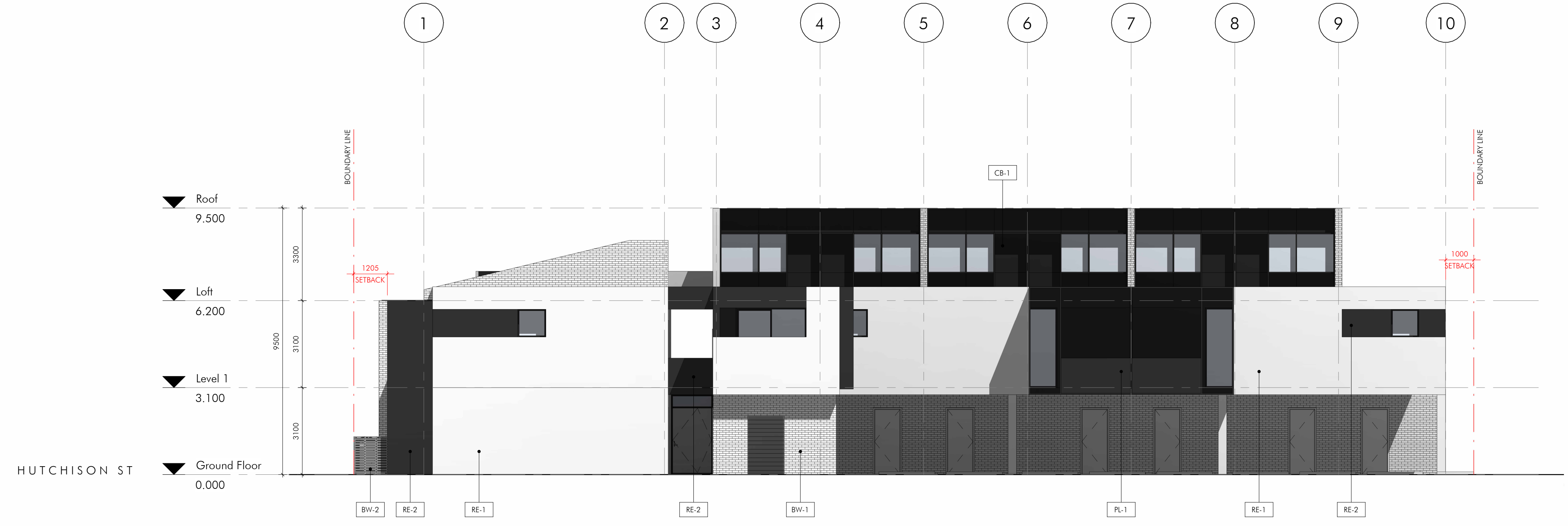
2 SOUTH ELEVATION 1:100