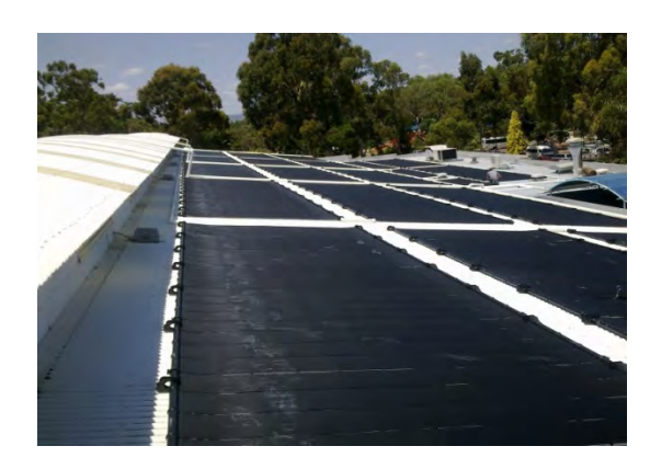
Solar pool heating system on the roof of Belmont Oasis Leisure Centre

City operations resulting in the generation of greenhouse gas emissions include energy use associated with buildings, streetlights, auxiliary lighting and parks (pumps, lighting and BBQs), emissions from vehicle fleet and plant, as well as the breakdown of waste resulting in methane generation.