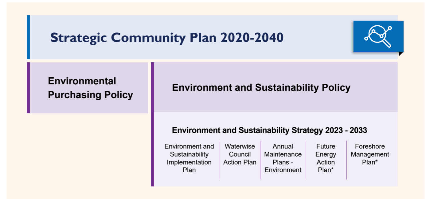
Figure 1 Components within the City’s Environmental Management System. *Proposed to be developed.