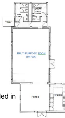
Areas Included in Hire