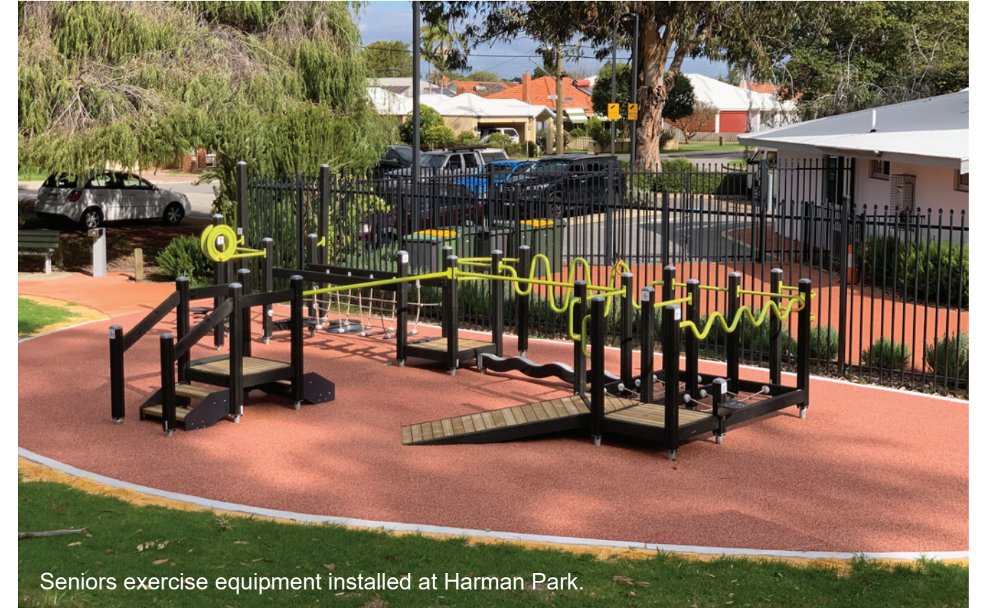
Seniors exercise equipment installed at Harman Park.

The City has continued to deliver on the outcomes and actions defined in the City's Age-Friendly Belmont Strategy 2017-2021. A number of highlights include the: