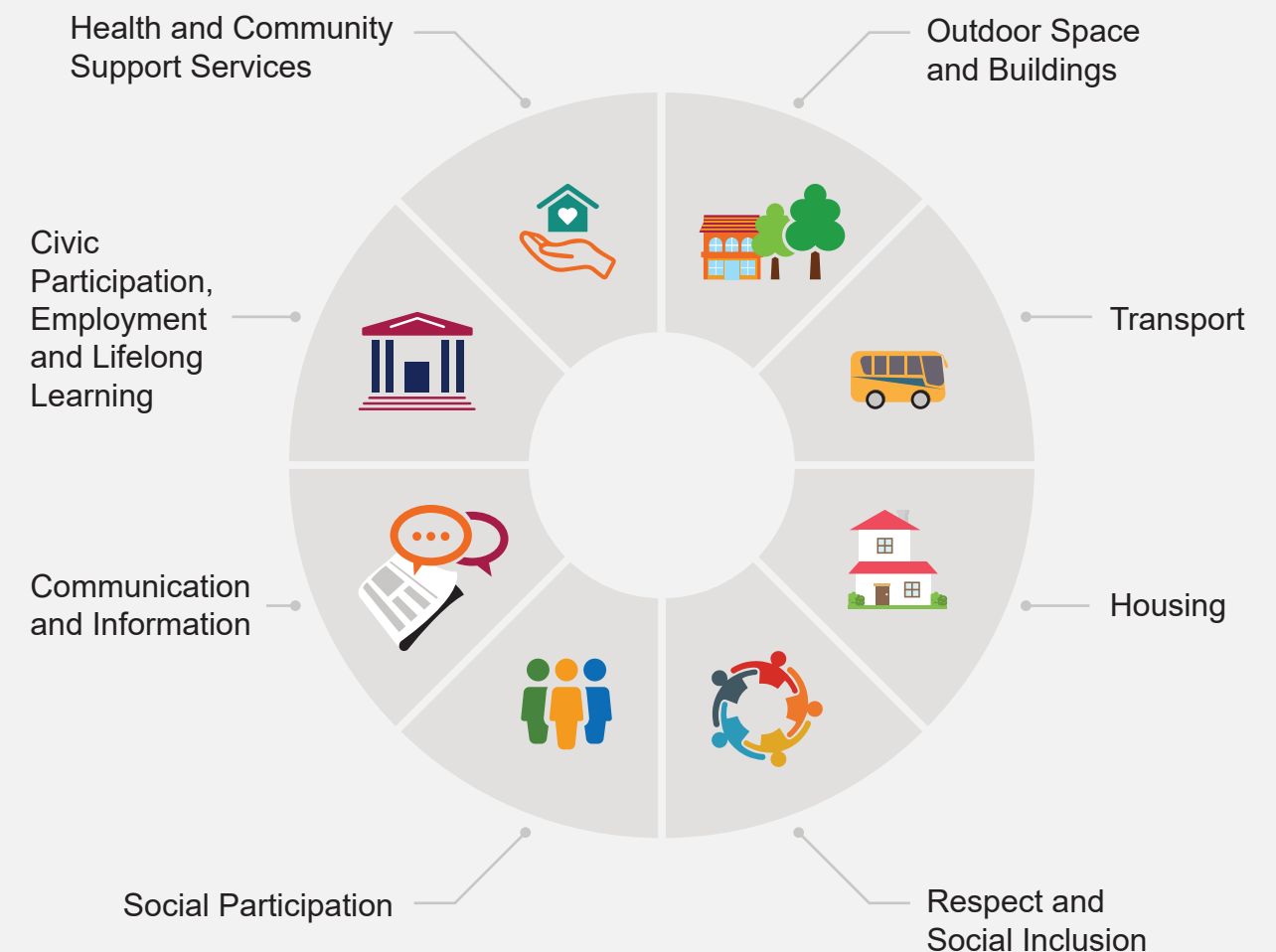
Diagram 1: Key Areas of a Age-Friendly community.

When a community is designed with older residents in mind, it becomes more accessible for everyone. For an individual to age well means to be able to do the things that are of value to them. An age friendly community considers 8 key areas as presented in diagram 1.