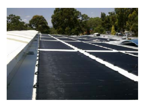
Solar pool heating system on the roof of Belmont Oasis Leisure Centre

City operations resulting in the generation of greenhouse gas emissions include energy use associated with buildings, streetlights, auxiliary lighting and parks (pumps, lighting and BBQs), emissions from vehicle fleet and plant, as well as the breakdown of waste resulting in methane generation.