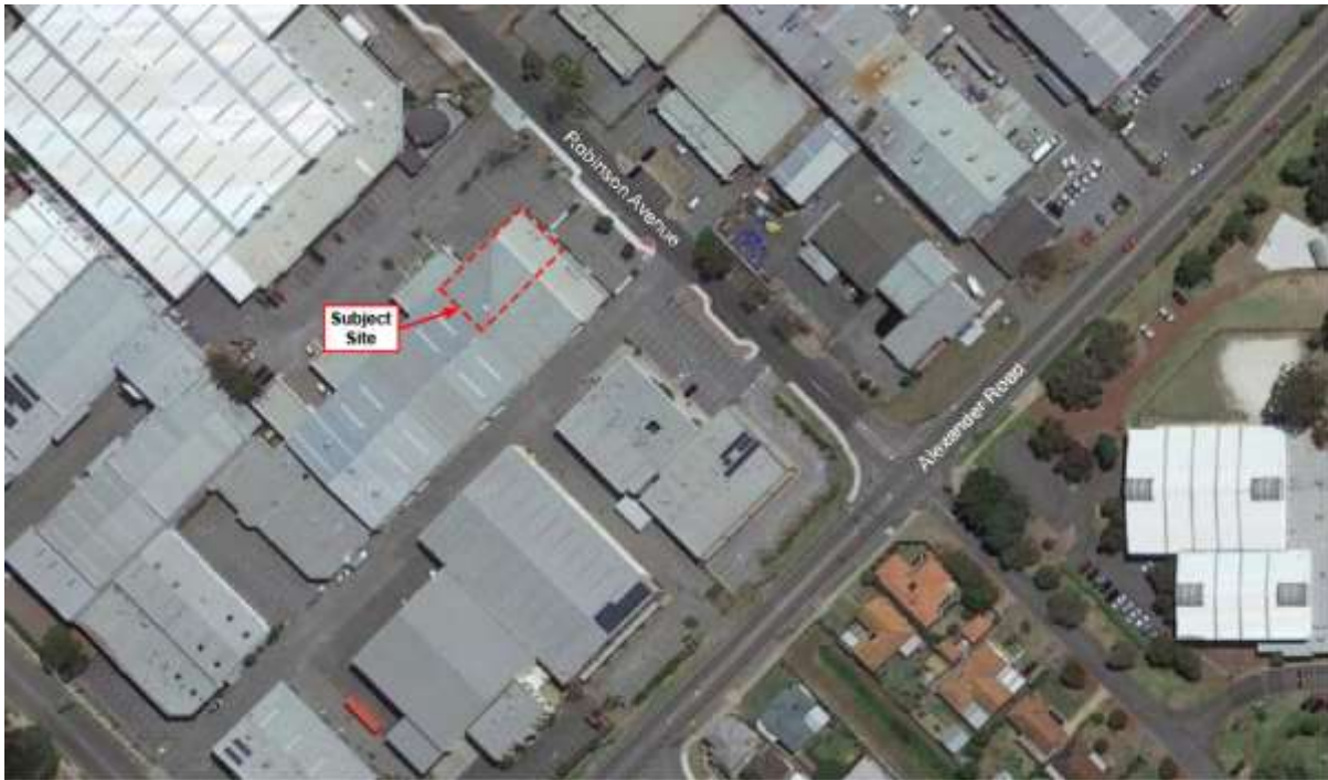
Figure 1 - Site Location

The site is a street frontage lot facing towards Robinson Avenue and is directly surrounded by commercial tenancies as part of a 6 unit commercial building strata complex. The strata complex lot itself is surrounded by a variety of commercial, light industrial and mixed business.