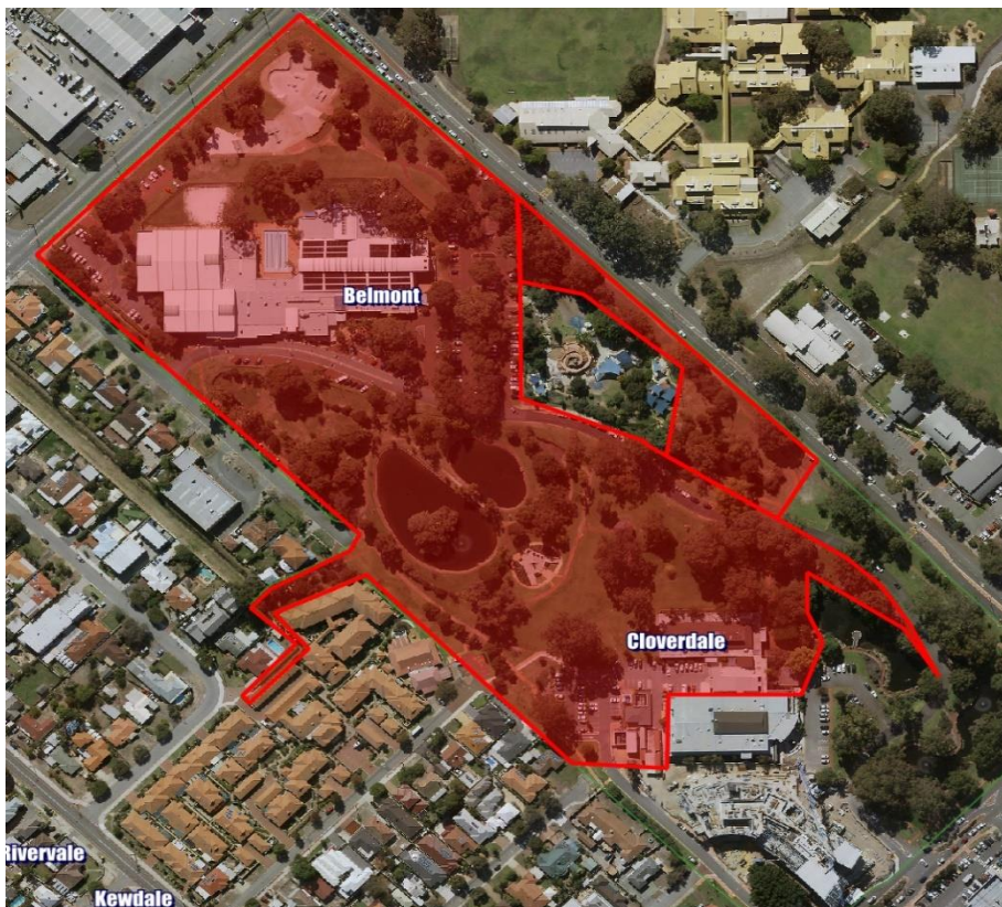
Figure 1. Extent of 2021/2022 Irrigation System renewal