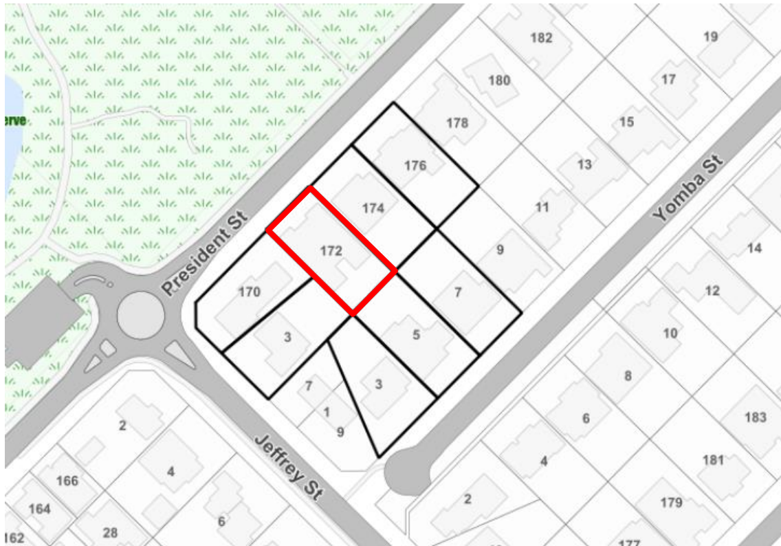
Figure 2: Referral Area (owners and occupiers – subject site in RED)

At the conclusion of the advertising period, three submissions were received: two supporting and one objecting to the retrospective application.