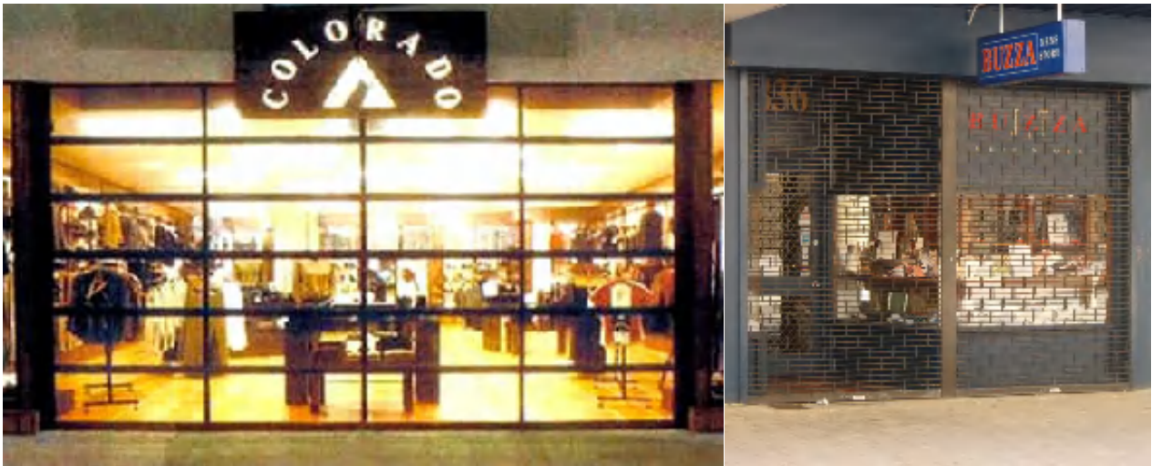
Figure 1: Examples of Roller Shutters and Security Grills that do not require Planning Approval.