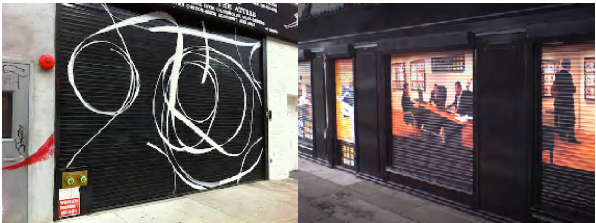
Figure 2: Examples of Roller Shutters that incorporate a decorative graphic design which relates directly to the business.

Should you have an alternate solution from those suggested above that still meet the City's objectives, these can be considered on a case by case basis.