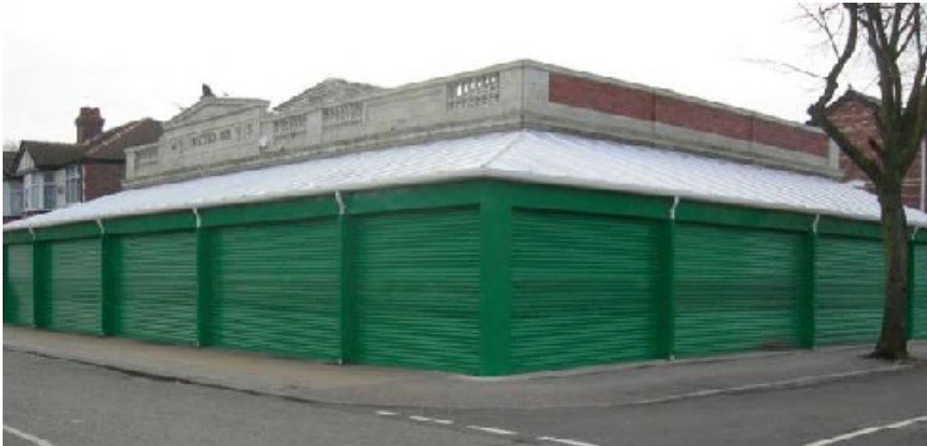
Figure 3: Example of Solid Roller Shutters that will not be supported by the City.

The City does not support roller shutters that are closed during the day and/or constructed of a poor quality.